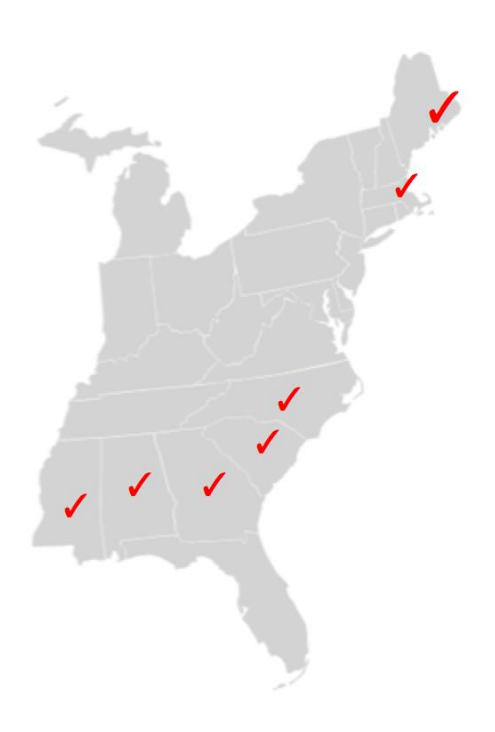
Figure 1. Implementations of VCAPS